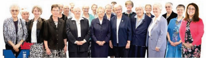
Sisters of the Holy Names of Jesus and Mary at the Marian Awards Brunch, May 2019

Join the Academy at the Gala as we pay tribute to the SNJM for their unwavering commitment to learning, faith, service and leadership.